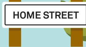
A street sign