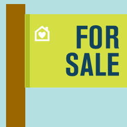
A 'for sale' sign