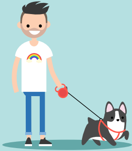
A dog on a walk