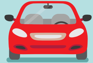
A red car